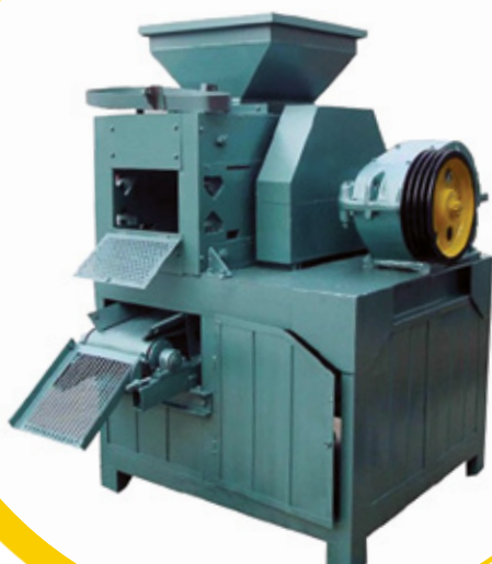
AIDPOL® BIOMASS BRIQUETTING PRESS